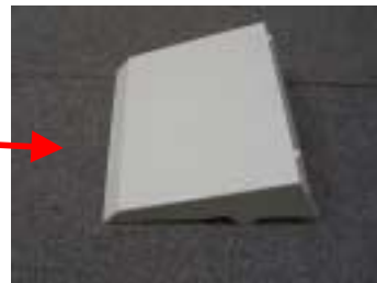
B7067631 TRAY:AUXILIARY:SHIFT TRAY