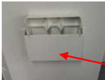
B0391321 HOLDER:OPERATING INSTRUCTIONS:A5-NRC:ASS'Y

Reason: To improve paper stack accuracy for Z-fold paper.